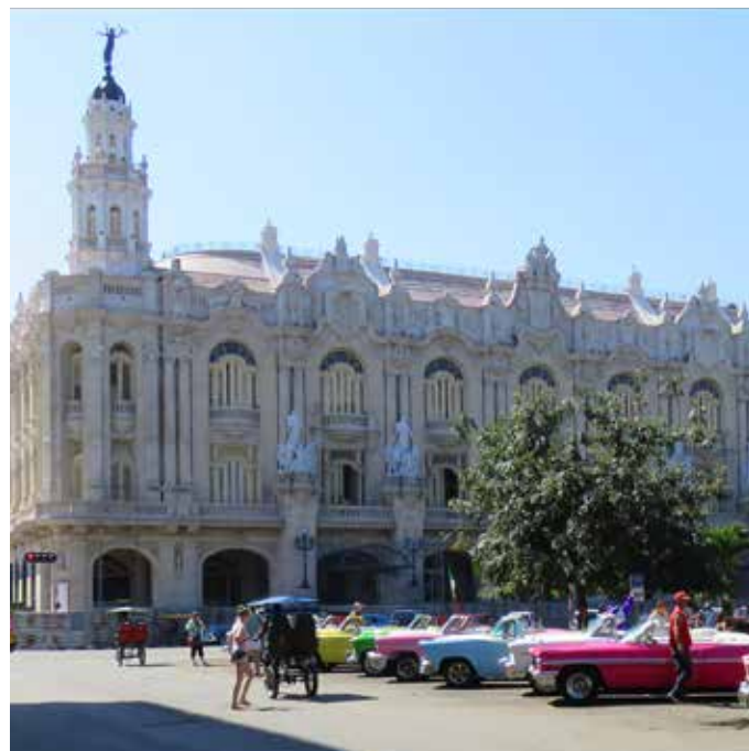
Gran Teatro de la Habana and a colorful array of vintage cars, Havana

Transfer to the airport for flights home.