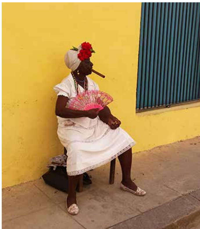
A colorful Habanese with her cigar, Havana