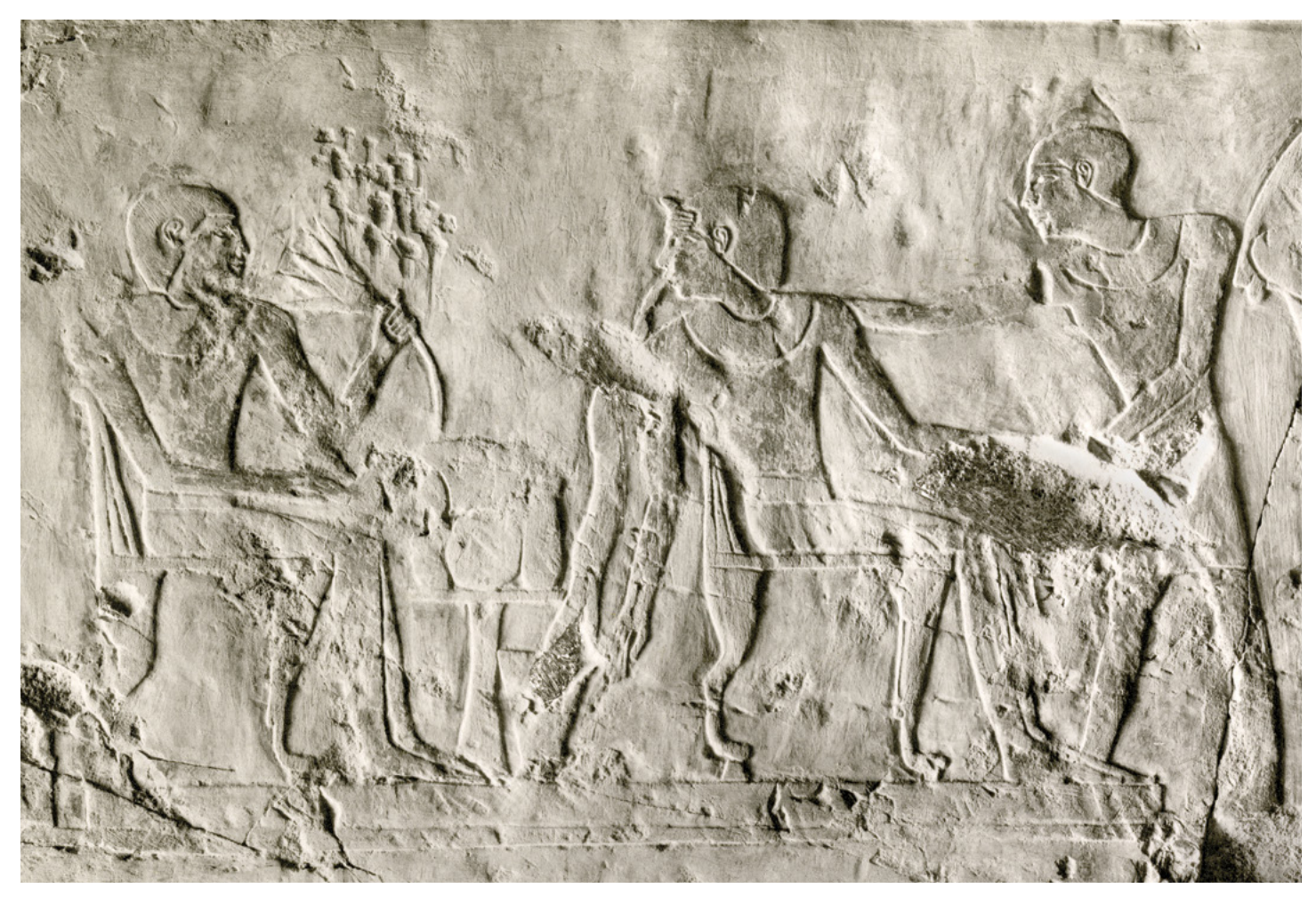
Detail of a banquet scene showing a guest vomiting into a jar after excessive alcohol consumption. From the tomb of Amenemhat (ca. 1479–1425 B.C.) in Thebes (modern Luxor)

Public processions were a fundamental element of most religious festivals. Priests, accompanied by music and singing, carried deity statues or sacred objects from the sanctuaries to other locations within the temple precinct or along public routes between different temples. Processions leaving the temple offered average Egyptians rare opportunities to get close to their deities, as access to the innermost parts of temples was highly restricted. For spectators gathered along the processional routes, being so close to a deity must have been an exhilarating experience. A hymn sung during a procession appropriately began with the words: "The heaven is cheering; the land is in festival."