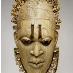
Pendant Mask: lyoba , 16th century Nigeria; Edo peoples, Court of Benin Ivory, iron, copper (?); H. 9 3/8 in. (23.8 cm) The Michael C. Rockefeller Memorial Collection, Gift of Nelson A. Rockefeller, 1972 (1978.412.323)