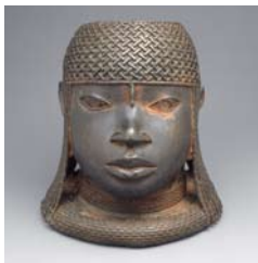
Head of an Oba , 16th century (ca. 1550) Nigeria; Edo peoples, Court of Benin Brass; H. 9 1/4 in. (23.5 cm) The Michael C. Rockefeller Memorial Collection, Bequest of Nelson A. Rockefeller, 1979 (1979.206.86)