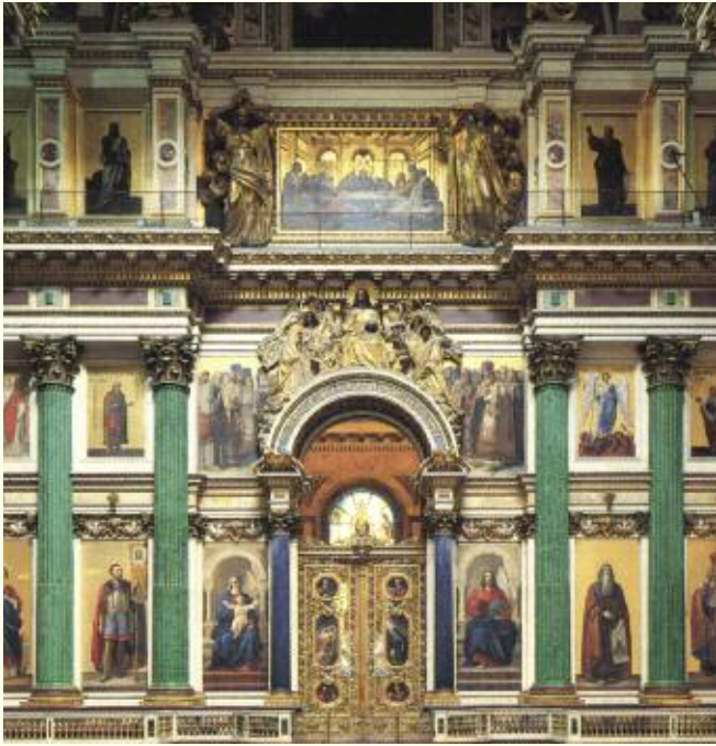
Interior, St. Isaac's Cathedral.