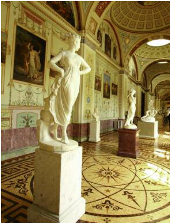
Gallery in the Hermitage.

In St. Petersburg we explore the Hermitage and the Russian Museum, where masterpieces are the norm. Other highlights are a troika ride across the snow-covered landscape in the royal park of Pavlovsk Palace; a performance by the famed Mariinsky company; a private operatic concert in the home of the composer Nicolai Rimsky-Korsakoff; and a gala New Year's Eve Ball in magnificent Catherine's Palace, the masterpiece of architect Rastrelli. Here the Russians will prove they remember all the traditions of flamboyant hospitality.