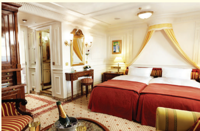
Sea Cloud II's Lido Deck (top) and Junior Suite (above)