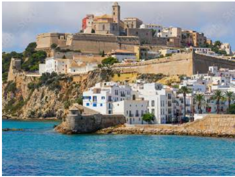
Dalt Vila, Ibiza Town