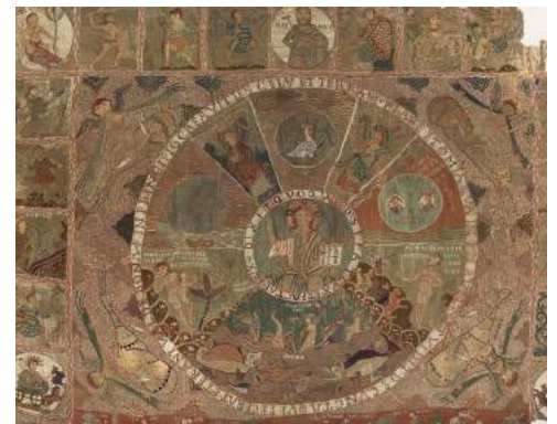
Tapestry of Creation, Catedral de Girona, Girona