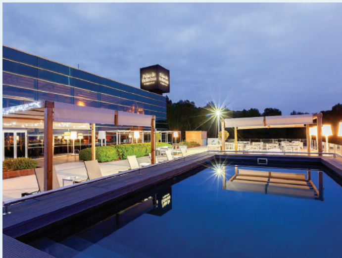
Hotel Palau de Bellavista Girona

This elegant hotel sits in a quiet corner next to Girona's Barri Vell (the historic old town). Combining chic design with impeccable service, the Hotel Palau de Bellavista features great views from the hotel's roof terrace as well as a bar and a pool.