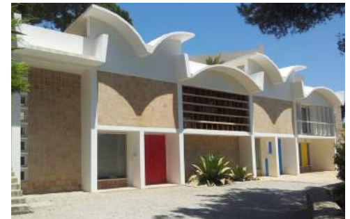
Fundació Pilar i Joan Miró a Mallorca, Mallorca

This itinerary is subject to change at the discretion of The Metropolitan Museum of Art and Arrangements Abroad. For complete details, please carefully read the terms and conditions at www.arrangementsabroad.com/terms .