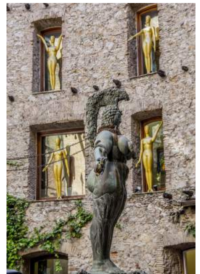
Teatre-Museu Dalí, Figueres, © Stefano Merli