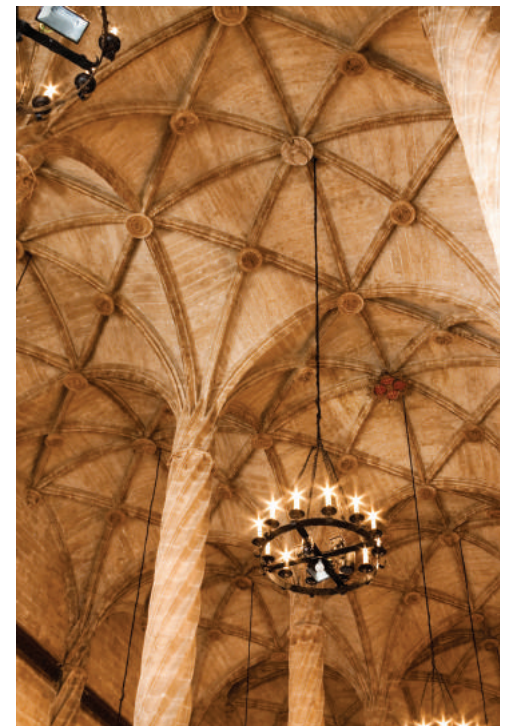
Photos clockwise from top right: Regional map; Museu d'Història dels Jueus, Girona; Lonja de la Seda, Valencia; Teatre-Museu Dalí, Figueres; Mercado Central, Valencia; Poblet Monastery, Poblet. Front cover: Catedral de Santa Maria de Palma de Mallorca, Palma de Mallorca. Back cover: Sea Cloud II (top); Ciudad de las Artes y las Ciencias, Valencia (bottom).