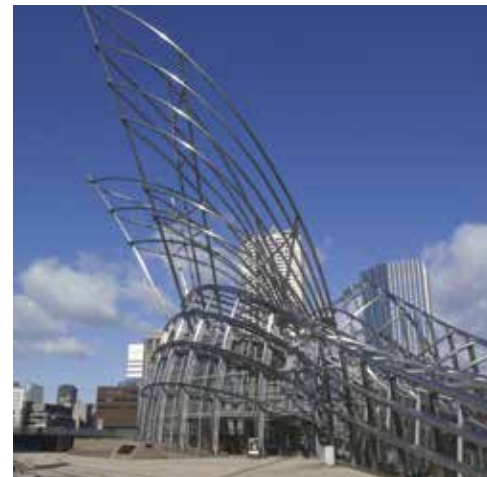
National Museum of Art, Osaka

This morning explore the Ando-designed Chichu Art Museum, established as a site to rethink the relationship between nature and people. Works by Claude Monet, Walter De Maria, and James Turrell are exhibited permanently within the building. Learn about the Naoshima Art House Project, which explores how to combine modern and traditional architectural styles. After lunch, visit the Lee Ufan Museum, also designed by Ando,