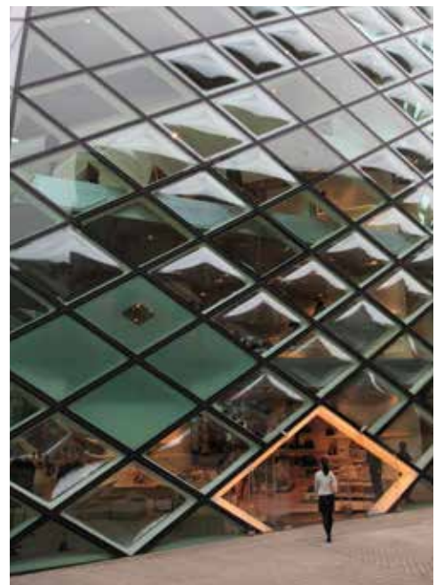
Photos clockwise from top right: 21_21 Design Sight; Kinkaku-ji temple; Prada building by Herzog and de Meuron; Tokyo; Sanjusangendo temple, Front cover: Yayoi Kusama's sculpture Pumpkin, near Benesse House on Naoshima Island, Back cover: Cherry Blossom Viewing at Itsukushima and Yoshino, Edo period (1615–1868), Pair of six-panel folding screens; ink, color, and gold leaf on paper. The Metropolitan Museum of Art, Mary Griggs Burke Collection, Gift of the Mary and Jackson Burke Foundation, 2015, [2015.300.1071,.2] (top); Byodo-in, Uji, (bottom).