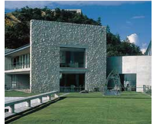
Hotel Benesse House

Designed by Tadao Ando to blend in with the surrounding national park, this unique property incorporates a museum and a hotel, with contemporary art displayed throughout the complex.