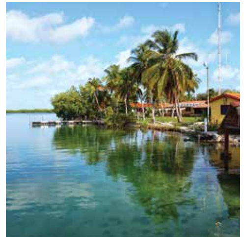
Cayo Largo