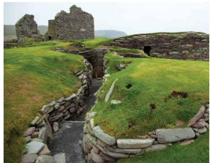
Jarlshof, Shetland Islands