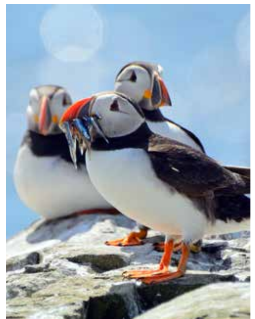
Photos clockwise from top right: Dunnottar Castle; pulpit, Stavanger Cathedral; puffin in the Shetland Islands; Norwegian Petroleum Museum; Crathes Castle; regional map. Front cover: Stones of Stennes, Kirkwall. Back cover: Sea Cloud II (top). Bryggen, Bergen (bottom).