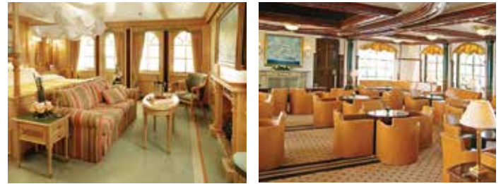
Sea Cloud II Owner's Suite (left) and lounge (right)

The sailing yacht Sea Cloud II is a three-masted barque steeped in the elegance of yesteryear and complemented with the most modern amenities. Sister ship of the legendary Sea Cloud , Sea Cloud II has 47 outside cabins and travels under 23 billowing sails trimmed by hand. From her mahogany-paneled library and gracious lounge to the fitness area and water sports platform, no detail has been overlooked. Praised by the world's most discerning travelers, Sea Cloud II receives consistent high rankings from Condé Nast Traveler . She celebrated her 15th anniversary in 2016.