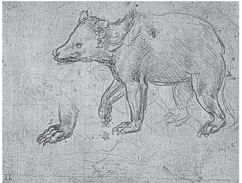
Leonardo da Vinci ([Florentine] Italian 1452–1519); A Bear Walking , ca. 1490; Robert Lehman Collection, 1975 (1975.1.369)

A sketch is a simple drawing. It doesn't have to be perfect or even have many details. In fact, artists create sketches just to work out an idea or get warmed up. As you sketch in the Museum, experiment—try a few techniques and see what works best for you!