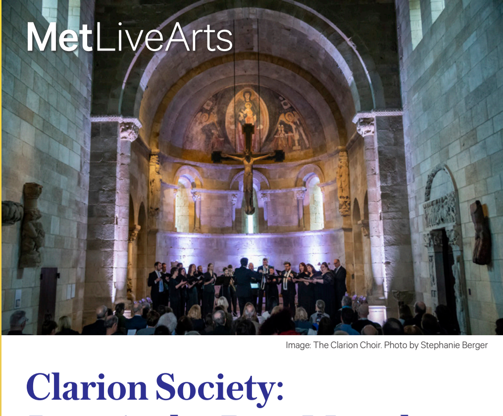
Image: The Clarion Choir.