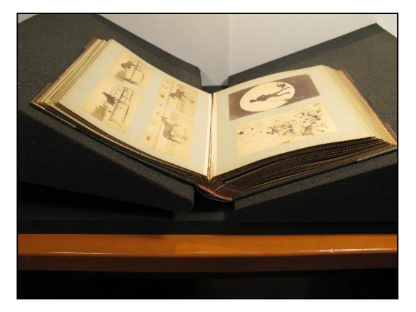
D. Cradle for opening at front