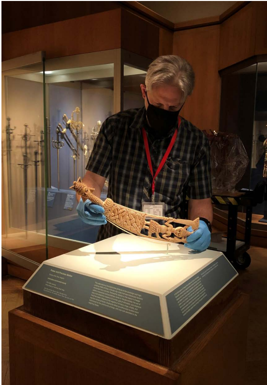
Opposite Page: Biface, ca. 400,000–150,000 B.C. (2019.422)