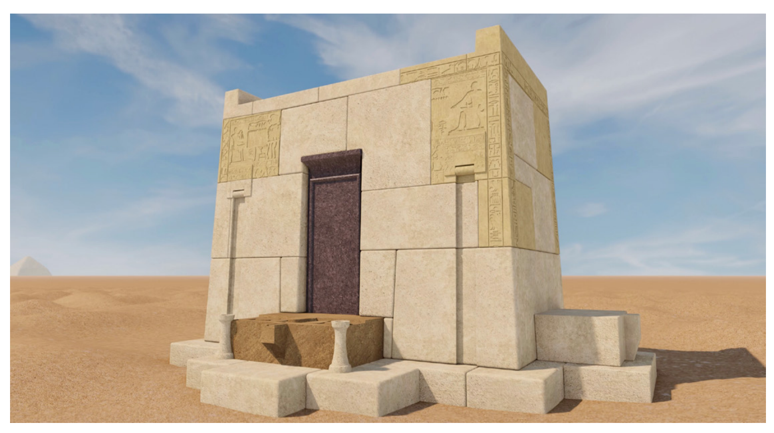
Still image from an animated reconstruction of the Khentykhetyemsaef mastaba north of the pyramid complex of Senwosret III at Dahshur. Animation by Sara Chen

areas of Malqata. The results of their ongoing studies are currently being prepared for forthcoming publications.