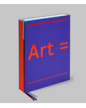
The jacket of Art= Discovering Infinite Connections in Art History

covers many different topics, such as the histories of the Middle and New Kingdoms, amulets, and hippopotami, and features many of the objects in our collection.