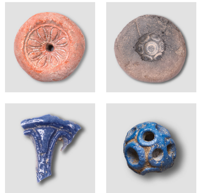
Molds for a rosette (upper left) and cage bead (upper right), with a fragment from a faience rosette in the lower left and a finished cage bead on the lower right

Recently we have been considering the single-sided ceramic molds that have been found throughout the Industrial Site. Since the area was first opened in 2015, our team has recovered 101 of these small objects, which produced a variety of object types. First emerging in the New Kingdom, these single-sided molds allowed for the mass production of rings, amulets, pendants, and certain types of beads from a glazed, non-clay ceramic material we call faience. Faience paste would have been pressed into the mold and then allowed to dry. After setting, each impression would have been removed, possibly reworked, dried, and then baked. While these faience impressions were most often used to create pendants and amulets for