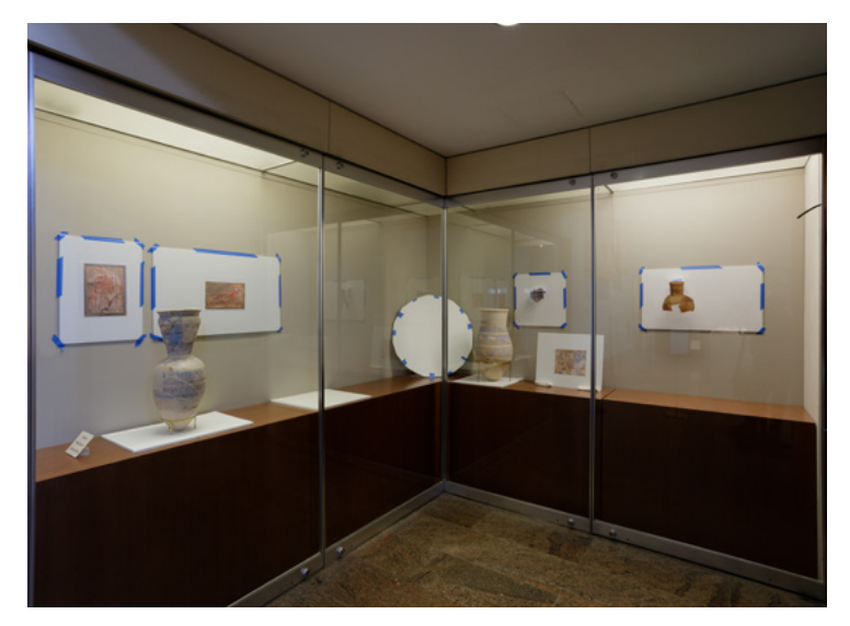
Mock-up for the reinstallation of the Malqata Niche in Gallery 119

Gallery 119 Malqata Niche. In August 2019, a leak from an elevator above Gallery 119 damaged the niche's walls and the wood pedestals holding the pottery and mud