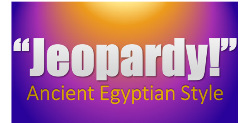
The opening image of our "'Jeopardy!' Ancient Egyptian Style" game

September 30, 2020. After an unprecedented summer, the Friends of Egyptian Art reunited to kick off our season with a very special event, "'Jeopardy!' Ancient Egyptian Style." Divided into three teams, everyone tested their knowledge of ancient Egyptian objects by identifying pieces in our collection from a photo providing only a detail. Looking at pieces from the Predynastic Period through the Roman Period, our Friends had an opportunity to show off their Egyptological prowess.