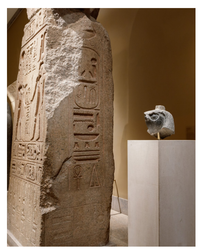
Statue of a Falcon-Headed God (66.99.72) in Gallery 123

Updating our Displays. Even while the Museum was closed, our collection was always on our minds. Despite working separately from our homes, we continued to consider what stories we could tell our visitors through our pieces. With the return to The Met, we resumed our work in the galleries and added to the display in Gallery 123 a larger than life-size falcon head with a divine wig (66.99.72), which now invites visitors to consider the nature of sacred imagery in ancient Egypt. In Gallery 124, an Asiatic prisoner, who appears at the bottom of a statue base (1990.232), now prostrates himself alongside an Egyptian statue of the Near Eastern god Reshef (89.2.215), highlighting the multifaceted nature of ethnicity in ancient Egypt.