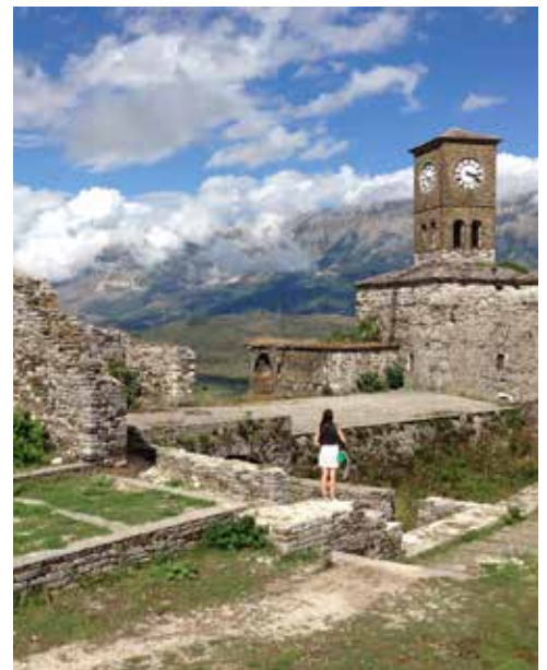
Photos clockwise from top right: Mausoleum of Galla Placidia, Ravenna; façade of Basilica di Santa Croce, Lecce; Gjirokaster, Albania; regional map; Grand Canal, Venice. Front cover: Dubrovnik. Back cover: Sea Cloud II (top); Dubrovnik, Croatia (bottom).