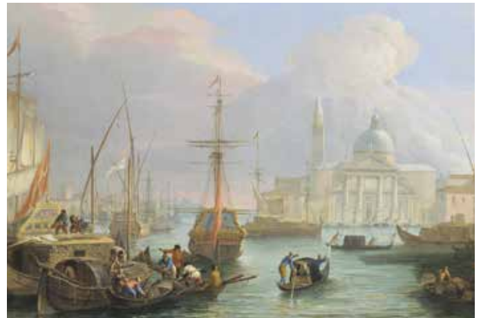
The Bacino, Venice, with the Dogana and a Distant View of the Isola di San Giorgio (detail), ca. 1709. Luca Carlevaris (Italian, Udine 1663/65–1730 Venice). Oil on canvas. The Metropolitan Museum of Art, Robert Lehman Collection, 1975 [1975.1.88]