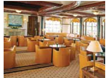
Owner's Suite (left) and lounge (right)

The sailing yacht Sea Cloud II is a three-masted barque steeped in the elegance of yesteryear and complemented with the most modern amenities. Sister ship of the legendary Sea Cloud , Sea Cloud II has 47 outside cabins and travels under 23 billowing sails trimmed by hand. From her mahogany-paneled library and gracious lounge to the fitness area and water sports platform, no detail has been overlooked. Praised by the world's most discerning travelers, Sea Cloud II consistently receives high rankings from Condé Nast Traveler .