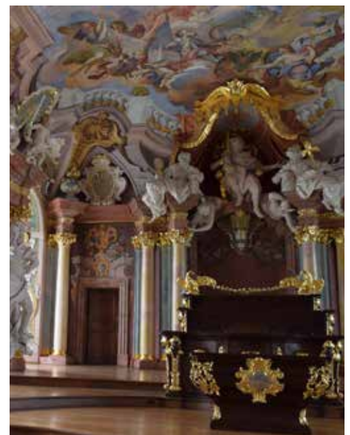
Photos clockwise from top right: Centennial Hall, Wrocław, Saxon Gardens, Warsaw, Leopoldina Hall, Wrocław, St. George's Basilica, Prague, Wawel Castle, Kraków, regional map. Front cover: Interior View of Vladislav Hall at Prague Castle during the Annual Fair, 1607. Aegidius Sadeler II (Netherlandish, Antwerp 1568–1629 Prague). Engraving. Back cover: Strahov Library, Prague, (top); Spanish Synagogue, Prague, (bottom).