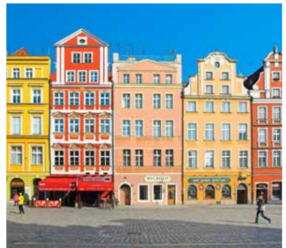
Salt Market (Plac Solny), Wrocław