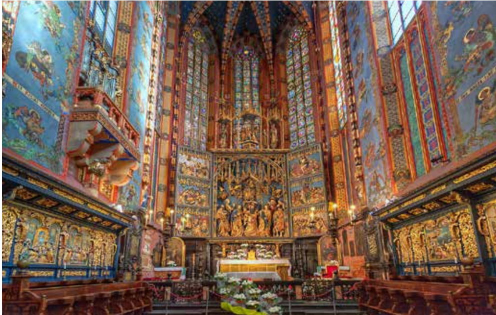
St. Mary's Basilica, Kraków