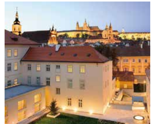
Mandarin Oriental, Prague

This luxury hotel is housed in a historic 19th-century tenement building.