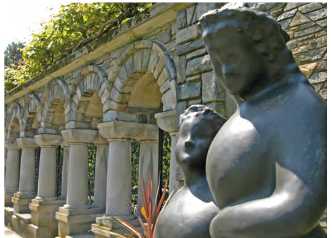
Inner Garden at Kykuit, photo © Bryan Haefele, courtesy of Kykuit