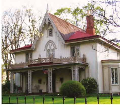
Delamater Inn, Rhinebeck, New York