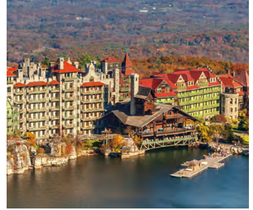
Mohonk Mountain House, New Paltz, New York

Poised along the banks of Lake Mohonk in the Hudson Valley, this unique resort is surrounded by carefully landscaped gardens and pristine wilderness. The warm interior is reminiscent of a bygone era—extensive woodwork, fireplaces constructed from Shawangunk stone, period accents, and expansive windows that frame the breathtaking scenery.