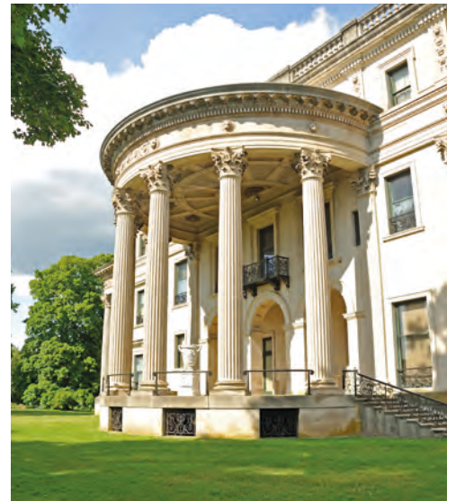
Photos clockwise from top right: Dock at the Mohonk Mountain House; stained-glass windows by Marc Chagall, Union Church of Pocantico Hills; Vanderbilt Mansion, Hyde Park; Storm King Art Center; Court Hall of the Main House at Olana; view of the Main House at Olana from the Summer House. Front cover: View on the Catskill—Early Autumn (detail), 1836–37. Thomas Cole (American, Lancashire 1801–1848 Catskill, New York). Oil on canvas. The Metropolitan Museum of Art, Gift in memory of Jonathan Sturges by his children, 1895 [95.13.3]. Back cover: The Palisades (detail), ca. 1870. John William Hill (American [born England], London 1812–1879 West Nyack, New York). Watercolor and gouache on white wove paper. The Metropolitan Museum of Art, Morris K. Jesup Fund, 1993 [1993.528] (top) and Hudson River Valley (bottom).