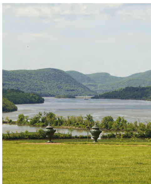
View from Boscobel