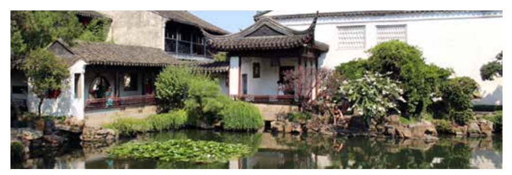
Master of the Fishing Nets, Suzhou