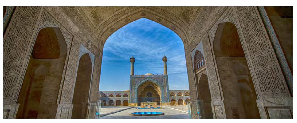
Masjed-e Jameh, Isfahan

Drive to fashionable northern Tehran for a visit to the Niavaran Palace complex, set among the foothills of the Alborz mountains. See the former Pahlavi residences and tour the museum of paintings and artifacts collected by Farah Diba, the last Empress of Iran. Return to central Tehran for lunch. Then visit the Jewels Museum, housed in the vaults of the Central Bank of Iran, displaying one of the most dazzling collections in the world, including the legendary Peacock Throne. Following dinner, transfer to the airport for the flights home, departing very early the morning of May 7. Our hotel rooms are reserved for late check-out. B. L. D