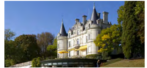
Domain de la Tortinière, Loire Valley