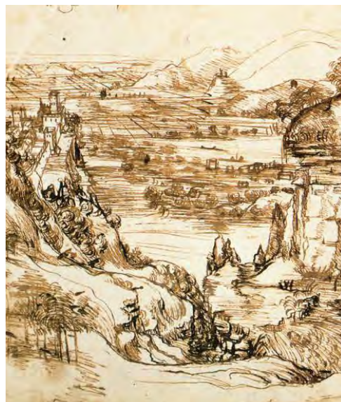
Leonardo's Landscape drawing for Santa Maria della Neve (detail), Uffizi Gallery, Florence

This morning visit the Uffizi Gallery, a 16th-century Medici Renaissance palace, to view Leonardo's early works, The Annunciation and The Adoration of the Magi . Take a secret corridor to reach Palazzo Vecchio, the city hall, and admire the Salone dei Cinquecento, with a sculpture by Michelangelo and fresco by Giorgio Vasari. In the afternoon, enjoy a private visit to the Opificio delle Pietre Dure, an art restoration laboratory. Meet conservation experts and look at a few masterpieces under restoration. Dinner is at Palazzo Borghese, the fine residence of a noble family in the 15th century. B, D