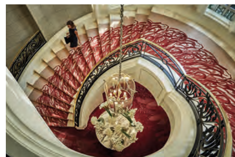
Room (top); lobby (above) Four Seasons Hotel Mexico City