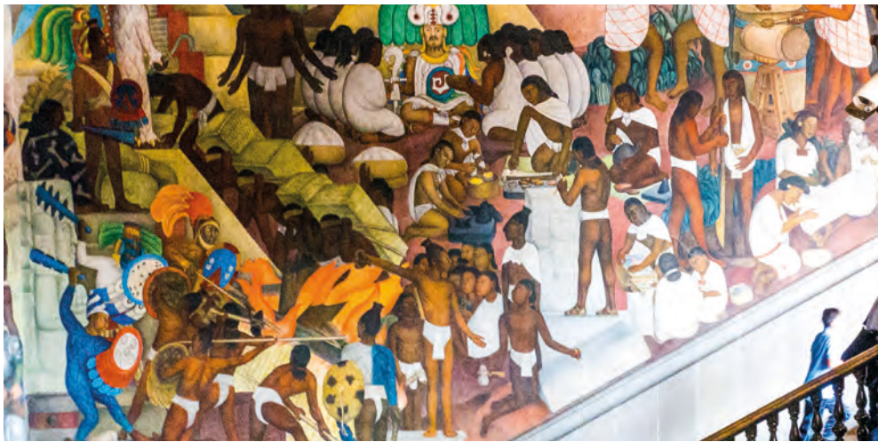
Epic of the Mexican People mural by Diego Rivera, National Palace, Mexico City

An optional prelude is offered in Palenque February 12-15, 2019.