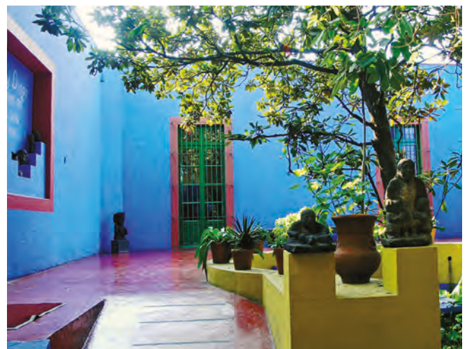
Blue House