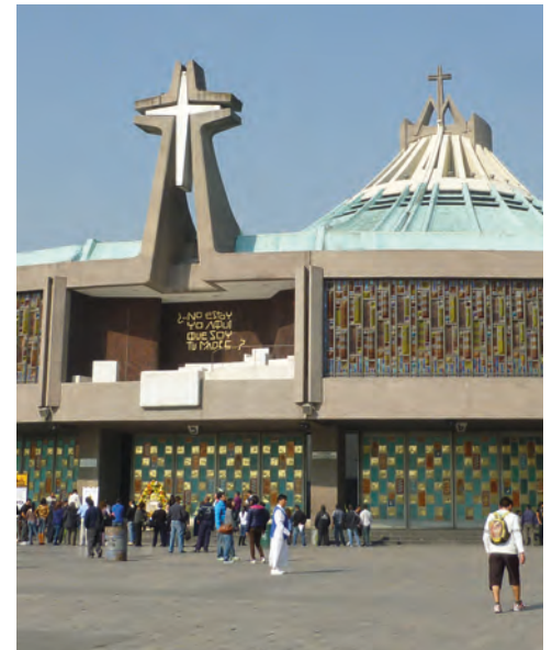
Basilica of our Lady of Guadalupe, Mexico City