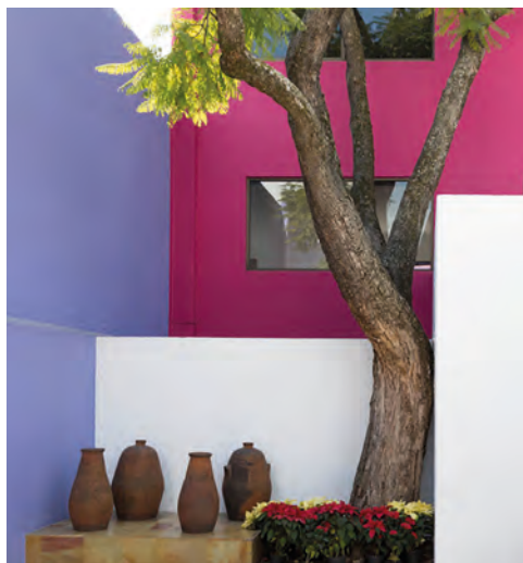
Luis Barragán House and Studio, Mexico City