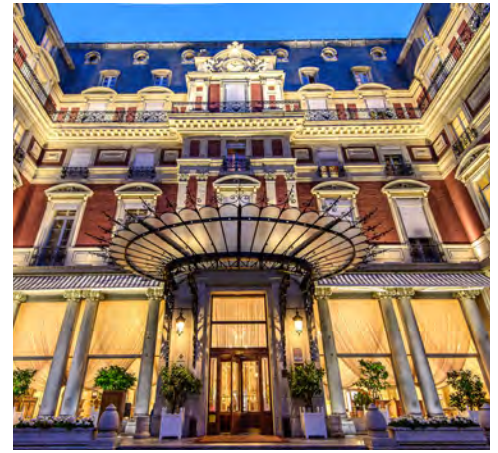
Hôtel du Palais, Biarritz

International airfare; passport fees; meals not specified; alcoholic beverages other than as noted in inclusions; personal items and expenses; trip insurance; baggage in excess of one suitcase; optional prelude in Vitoria-Gasteiz; any other items not specifically mentioned as included.