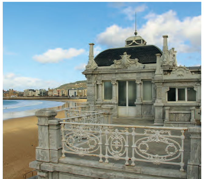
San Sebastián beachfront