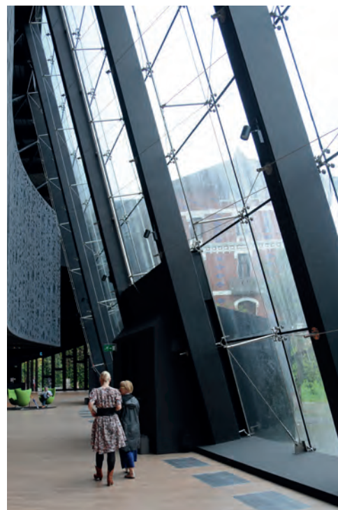
Cristóbal Balenciaga Museum, Getaria

At the San Telmo Museum, housed in a former convent, admire its collection of works by El Greco, Miró, and other great artists, and see the famed Sert Canvases depicting important events in Basque history. After lunch, the remainder of the day is at leisure; you may wish to sample one of the Michelin-starred eateries (San Sebastián has 10), browse the fish market, or discover the 16th-century Iglesia de San Vicente. B, L