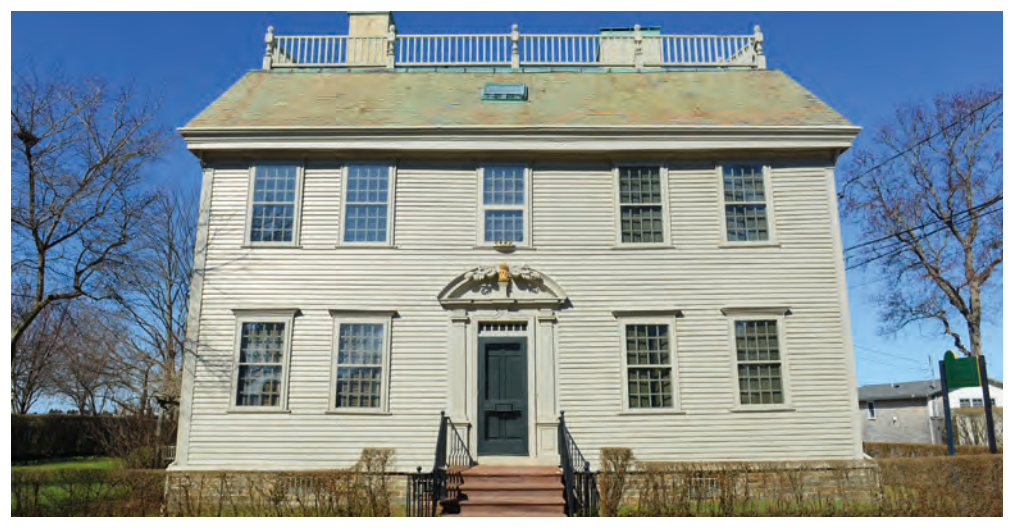
Hunter House, Newport

Take in a private visit at the Vernon House, an architecturally distinguished colonial-era house and National Historic Landmark with extraordinary Asian-inspired wall murals. During the American Revolutionary War, Vernon House served as the headquarters of the Comte de Rochambeau, commander