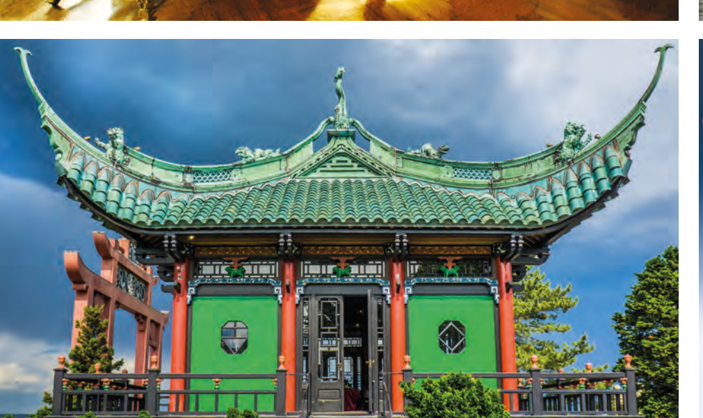
Photos clockwise from top right; Map of the region; Bowen's Wharf, Newport, photo courtesy of Discover Newport; Tea Table, Newport, Rhode Island, ca. 1770, Mahogany, collection of the Whitehorne House Museum, Newport; Tea House at Marble House, Newport; Dining room at Marble House, Newport; Isaac Bell House, Newport, photo courtesy of Discover Newport. Front cover: Marble House, Newport. Back cover: Castle Hill Light House, photo courtesy of DN (top) and Dining room at The Breakers (bottom).