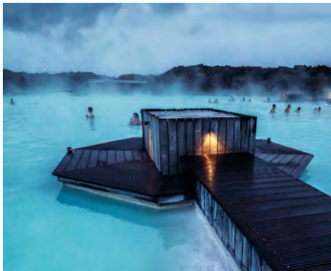
Blue Lagoon, Reykjavík

This itinerary is subject to change at the discretion of The Metropolitan Museum of Art and Arrangements Abroad. For complete details, please carefully read the terms and conditions at www.arrangementsabroad.com/terms .