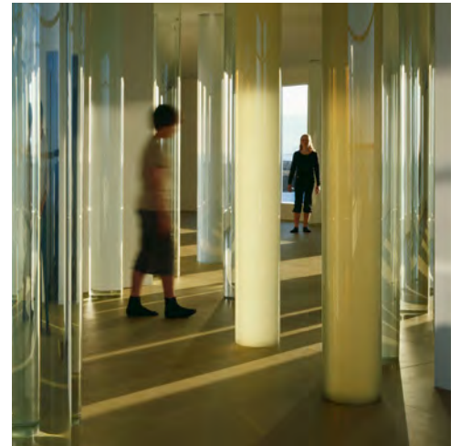
Roni Horn, Vatnasafn / Library of Water, 2007, Stykkishólmur

On an architectural driving tour of Reykjavík, see the 244-foot-tall Hallgrímskirkja (Hallgrims Church), designed by architect Guðjón Samúelsson and based on Iceland's characteristic basalt formations. View the sculptures of Iceland's first major sculptor, Einar Jónsson, in a special garden at his eponymous museum, the oldest in the country. Take a behind-the-scenes tour of Harpa, Reykjavík's concert hall and cultural center, which has a gleaming, glass honeycomb façade designed by Danish-Icelandic artist Olafur Eliasson. As you explore areas not open to the public, experience how Icelandic nature inspired