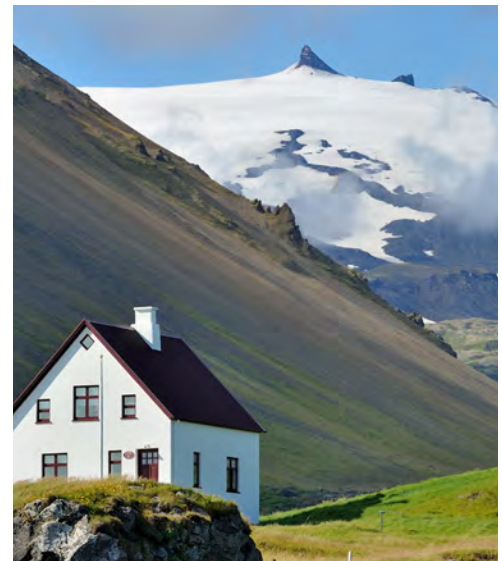
Photos clockwise from top right: Regional map; Puffins, Krýsuvíkurbjarg Cliffs; Snæfellsjökull volcano and glacier; Seljalandsfoss waterfall; Reykjavík; Jón Gunnar Árnason, Sólfar / Sun Voyager , 1990, Reykjavík, photo courtesy of Visit Iceland. Front cover: Hallgrímskirkja, Reykjavík, photo courtesy of Visit Iceland. Back cover: Viking World, Reykjanesbær, photo courtesy of Visit Iceland, by Icelandic Explorer (top); Gullfoss (bottom).