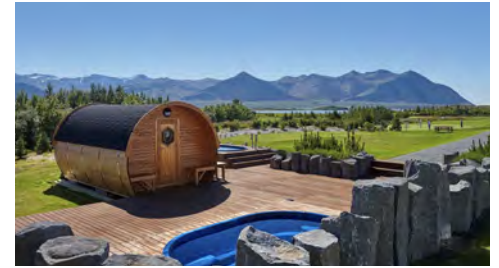
Hotel Hamar, Borgarnes

Hotel Borg offers intimacy and world-class service in the heart of Reykjavík. This four-star oasis was built in 1930 and has been marvelously restored to its original Art Deco style, with classic furnishings and paintings to match. Yet it also boasts 21st-century amenities, including Wi-Fi, modern spa, fitness center, and world-renowned dining.