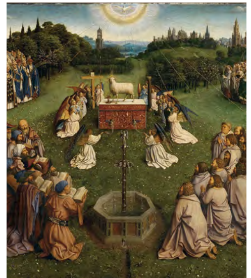
Ghent Altarpiece (The Adoration of the Mystic Lamb) (detail) by the Van Eyck Brothers, Ghent, photo courtesy of Visit Flanders.