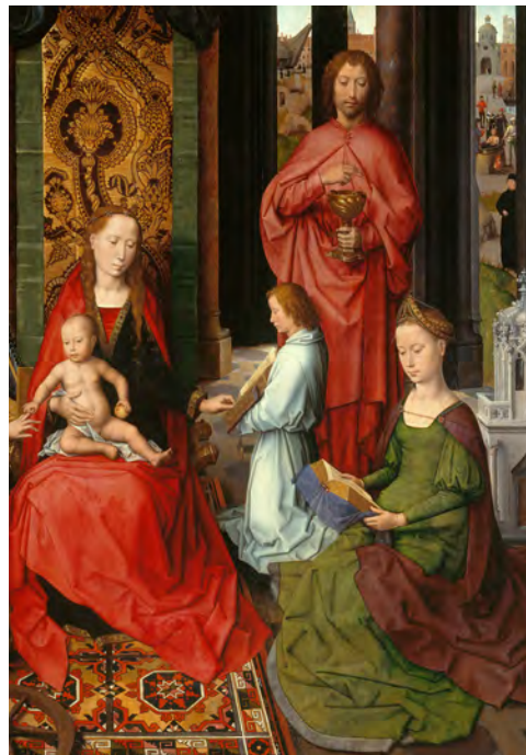
Hans Memling, Triptych of Saint John the Baptist and Saint John the Evangelist (detail) , c. 1479, Hans Memling Museum, Bruges, Belgium

This morning, step ashore to visit The Museum of Fine Arts Ghent. Then drive to Dendermonde, a small city known for its magnificent Flemish buildings. While here, visit the Church of Our Lady, home to two Van Dyck paintings, as well as a 12th-century baptismal font of Tournai stone. This evening, rejoin Magnifique IV in Sint-Amands, and enjoy a concert on board. B, L, D