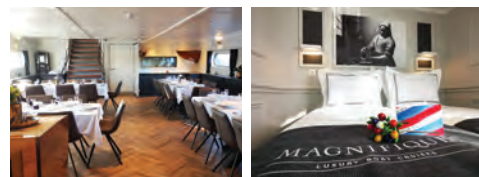
Magnifique IV photos clockwise from top: on deck; upper deck suite; and salon

Sailing under the Dutch flag, this new river vessel has 10 generous suites on the upper deck, while the lower deck has eight twin cabins. Magnifique IV's upper deck features a spacious and tastefully decorated salon with air conditioning, a bar, and lounge area. Wi-Fi is also available. The comfortable and inviting restaurant is separated from the kitchen by a glass wall, so you can watch talented chefs in action. The front deck has space to accommodate bicycles, while the top deck boasts a Jacuzzi and deckchairs, from which you can enjoy the scenery.