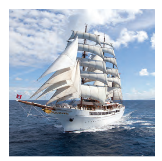
Sea Cloud II

An optional prelude in Istanbul is offered June 26–29, 2023.