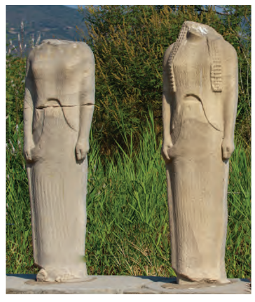
Heraion of Samos, Greece

This itinerary is subject to change at the discretion of The Metropolitan Museum of Art and Arrangements Abroad. For complete details, please carefully read the terms and conditions at www.arrangementsabroad.com/terms.