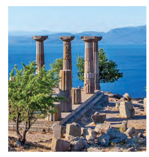
Ruins at Troy, Turkey