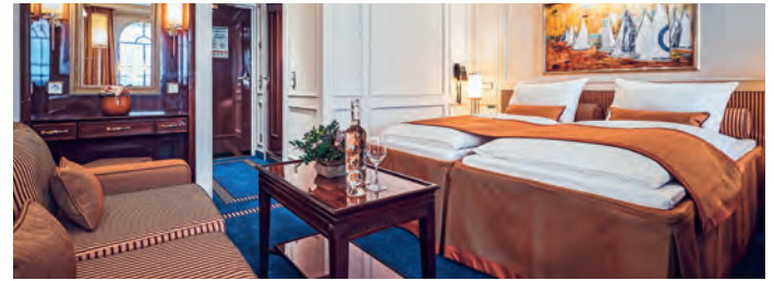
Junior Suite, Sea Cloud Spirit

In the autumn of 2021, the Sea Cloud family that brought us the iconic original Sea Cloud and the magnificent Sea Cloud II welcomed a new sister: the elegant, enchanting Sea Cloud Spirit . With its classic yacht atmosphere, this tall ship sets new standards in maritime luxury and includes hand-rigged sails and wonderful modern amenities unique in the Sea Cloud family, including select cabins with panoramic windows that open and an elevator connecting the decks, the first of its kind on a sailing ship. Sea Cloud Spirit is equipped with 69 outside cabins, 25 of them with balconies, comfortably carrying up to 136 guests. Enjoy its impressive and spacious wellness area with three treatment rooms, a Finnish sauna, a steam bath, and a hair salon.