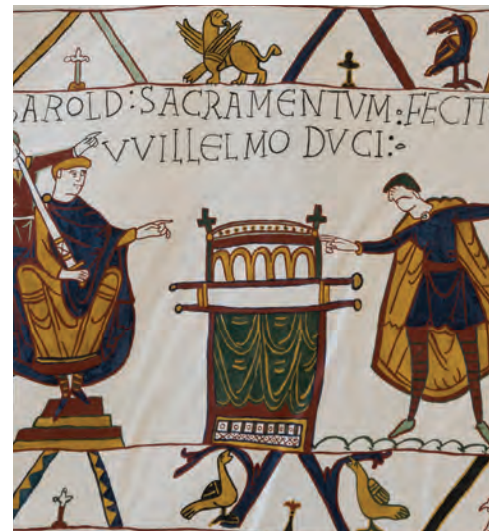
Bayeux Tapestry (detail), Bayeux, France