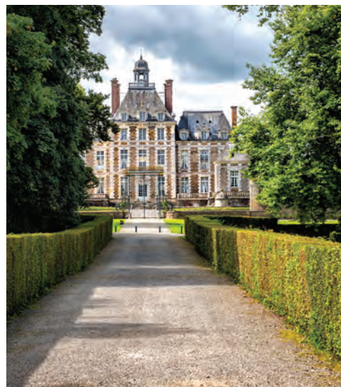
Château de Balleroy, Bayeux, France

From the port of Honfleur, visit historic Caen, whose Norman treasures have survived the centuries. Continue to Bayeux and the Memorial Museum of the Battle of Normandy. Then, visit the 11th-century cathedral and the Bayeux Tapestry , an embroidered depiction of the Norman Conquest and one of the most renowned works of art to survive from the Middle Ages. Stop at Malcolm Forbes's 17th-century Château de Balleroy to visit the Musée des Ballons, which houses Forbes's collection of hot-air balloons, and sip cocktails while enjoying views of its surrounding gardens. Return to the ship and sail west in the early evening for the Channel Islands. B, L, D