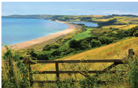
Slapton Sands, Dartmouth, U.K.