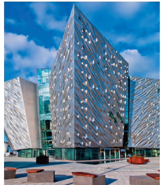
Photos clockwise from top right: Map of the region; On deck, Sea Cloud Spirit ; Titanic Museum, Belfast, Northern Ireland, photo courtesy of the Northern Ireland Tourist Board; Bayeux Cathedral, France; High street, Saint Peter Port, Guernsey, Channel Islands; Arch of Yellow Viburnum flowers, Bodnant Garden, Wales; Front cover: Honfleur Harbor, France by Johannes Valkama. Back cover: L'Abbaye-aux-Hommes, Caen, France (top); Sea Cloud Spirit (bottom).