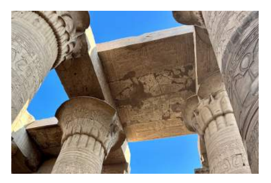
Abu Simbel, Small Temple