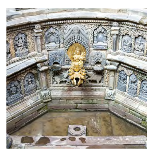
Ritual bathing pool, Hanuman Dhoka, Kathmandu

This morning, take a heritage walking tour exploring the Old Town with its bustling bazaar, dominated by the imposing 17thcentury Leh Palace and its museum. Continue to one of Ladakh's most breathtaking monasteries: Shey Palace and Monastery, with its colossal gilded statue of a seated Shakyamuni Buddha, considered to be the second-largest Buddha statue in Ladakh. Also visit Thiksey Gompa, a Buddhist monastery with beautiful prayer rooms and temples. After a picnic lunch, drive east to a secluded valley and the Hemis Monastery, one of Ladakh's wealthiest monasteries. Return to the hotel, or opt for a drive to the village of Choglamsar for a séance session with the village Oracle. B, L, D