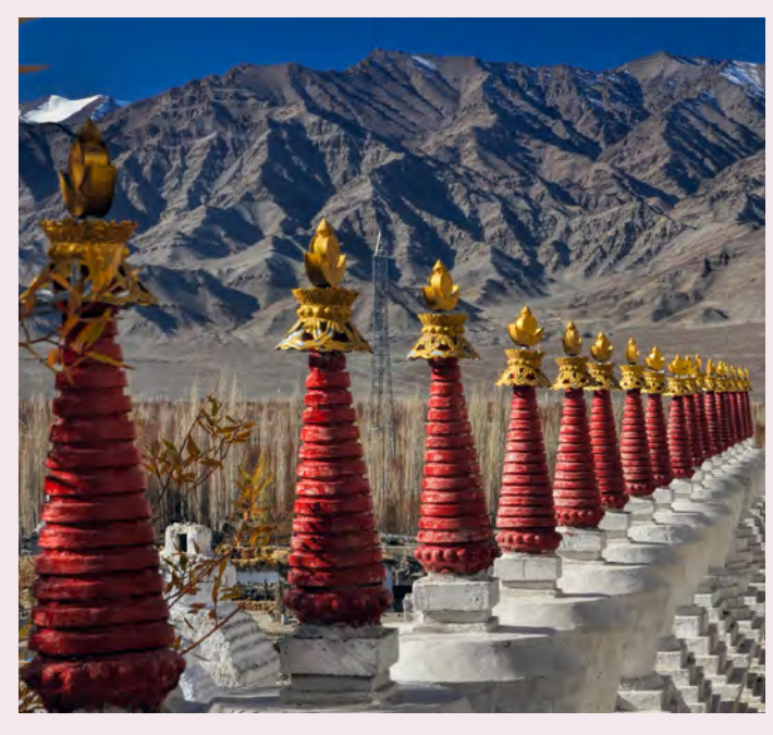
Photos from top: Temple carving, Patan Durbar Square, Kathmandu; Colorful thangka at the Hemis Monastery in Leh, Ladakh; Thiksey Monastery, Leh, Ladakh