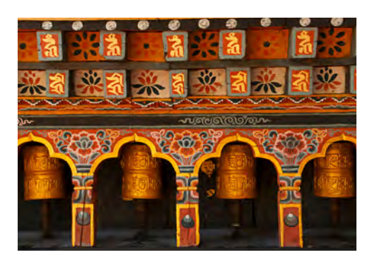
Prayer wheels, Thimphu

At nearby Ramthankha, gather for an optional half-day hike to the legendary Taktsang (Tiger's Nest), a breathtaking Buddhist monastery perched on a cliff 10,000 feet above the Paro Valley and one of the most sacred Buddhist sites. A less strenuous option will offer views of Tiger's Nest and a visit to view the ruins of Drukgyel Dzong, which was destroyed by a fire in 1951 but remains an impressive sight. B, L, D