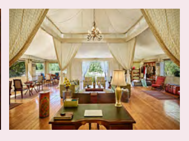
Photos clockwise from top: Trident Gurgaon, Delhi; TUTC Camp, Leh; Dwarika's Hotel, Kathmandu; COMO Uma, Punakha; COMO Uma, Paro