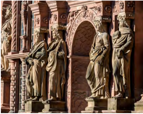
Heidelberg University, Germany