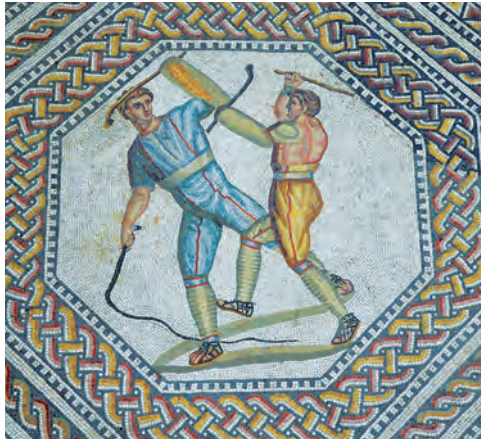
Roman mosaic, near Remich, Luxembourg

centerpiece of a palatial Roman villa. Composed of three million individual tile pieces, the mosaic floor depicts scenes of gladiatorial combat that would have taken place in local amphitheatres. B, L, D