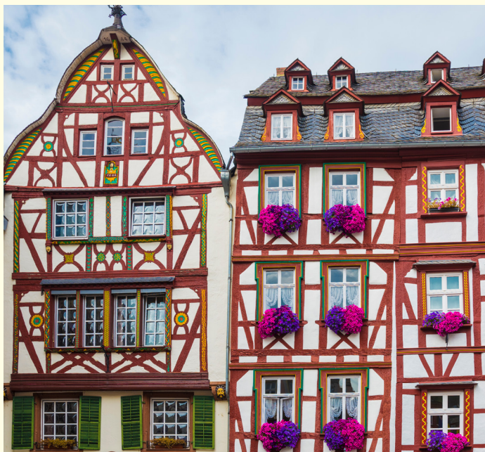
Photos from top: Cochem, Germany; Stained glass windows by Chagall, Metz Cathedral, Metz, France; and colorful houses in Berncastel-Kues, Germany