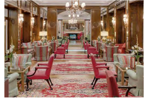
Hotel Europäischer Hof Heidelberg