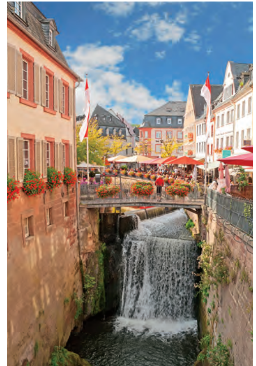
Photos clockwise from top right: Regional map; Gallery, City Museum Simeonstift, Trier; Saarburg; Porta Negra, Trier; Evening in the Market Square, Trier; Traben-Trarbach town gate. Front cover: Heidelberg. Back cover: Metz Cathedral (detail) (top); Moselle River Valley (bottom).