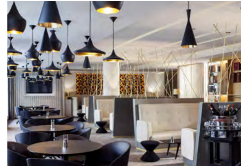
Sofitel Luxembourg Europe

This five-star hotel's luxury bedrooms guarantee the highest comfort with elegant, contemporary design, generous spaces, and sound isolation.