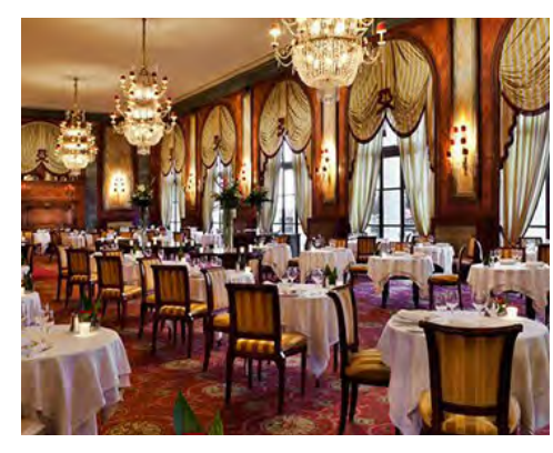
Hotel Barrière Le Normandy Deauville

With a joyful Belle Époque elegance, this hotel cultivates a sense of allencompassing comfort and dazzling Anglo-Norman style.