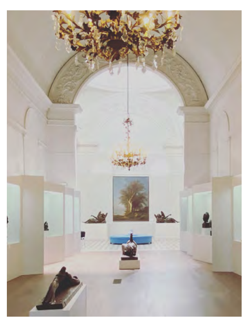
Musée Eugène Boudin, Honfleur

Drive the short distance to Honfleur, where you will enjoy a walking tour of this beautiful and historic town. Visit the Musée Eugène Boudin, which was established in 1960 in memory of Eugène Boudin, one of the first French landscape painters to paint outdoors.