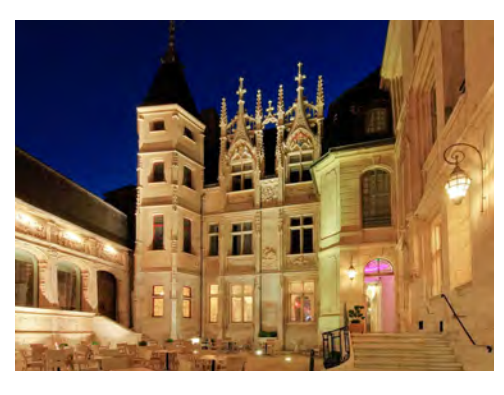
Hôtel de Bourgtheroulde, Autograph Collection, Rouen

International airfare; passport/visa fees; meals not specified; alcoholic beverages other than as noted in inclusions; personal items and expenses; airport transfers other than for those on suggested flights; excess baggage; trip insurance; any other items not specifically mentioned as included.