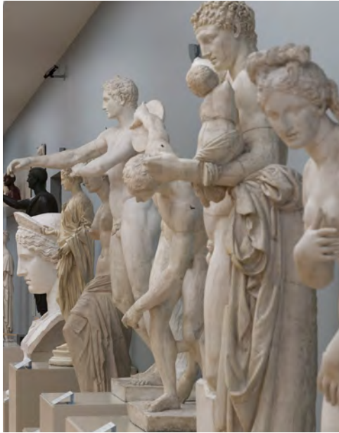
National Museum, Oslo