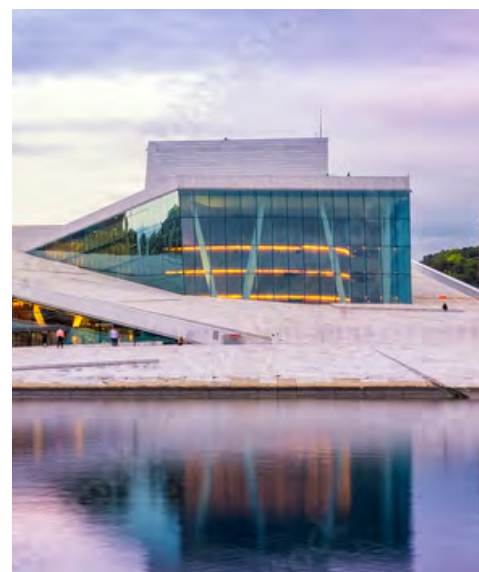
Opera House, Oslo