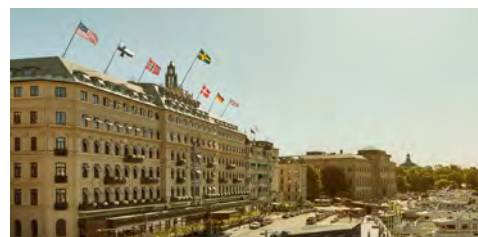
The Grand Hôtel, Stockholm