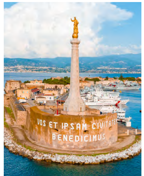
Madonna della Lettera statue, Strait of Messina, Sicily