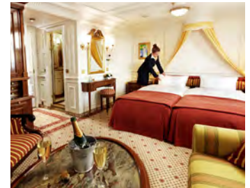
Sea Cloud II Lido Deck (left) and Junior Suite (right)

Sea Cloud II is a three-masted sailing yacht steeped in the elegance of yesteryear and complemented with the most modern amenities. Sister ship of the legendary Sea Cloud , Sea Cloud II has 47 outside cabins and travels under 23 billowing sails trimmed by hand. From the mahogany-paneled library and gracious lounge to the gym and watersports platform, no detail has been overlooked. Praised by the world's most discerning travelers, Sea Cloud II receives consistently high rankings from Condé Nast Traveler . Passengers enjoy open seating at all meals and complimentary use of all water sports equipment. A doctor is on call 24 hours a day. Please note: There is no elevator on Sea Cloud II .