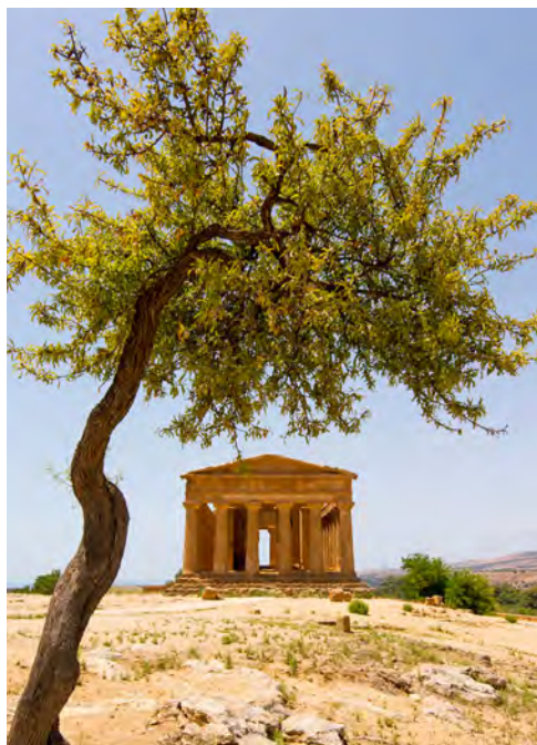
Valle dei Templi, Sicily

An optional prelude in Valletta is offered from October 8 – 11, 2023.