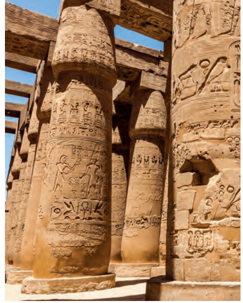
Photos clockwise from top right: The Statue of Decebalus on the Danube, Romania; Domes of the Uglich Kremlin, Russia; The Great Hypostyle Hall, Karnak, Egypt; Majorelle Gardens, Morocco; Lounge, Train Suite Shiki-shima, Japan; Sea Cloud II. Photos: Inside top left: Alhambra, Granada, Spain. Front cover: Gardens by the Bay, Singapore. Back cover: The Danube, Budapest, Hungary (top); Statues at Angkor Wat, Cambodia (bottom).