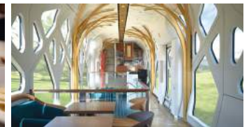
Photos clockwise from top left: Train Suite Shiki-shima; Suite; Lounge; Cuisine