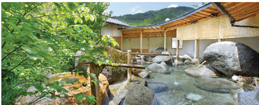
Restaurant, Train Suite Shiki-shima (top) and onsen in Atsumi (above)