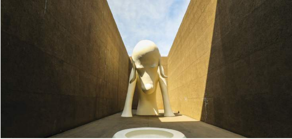
Aomori Museum of Art

cuisine distinctive and delicious. Finally, take an exclusive retro-tram ride back to Hakodate Station before departing for one of three Hokkaido onsens for the night. B, L, D