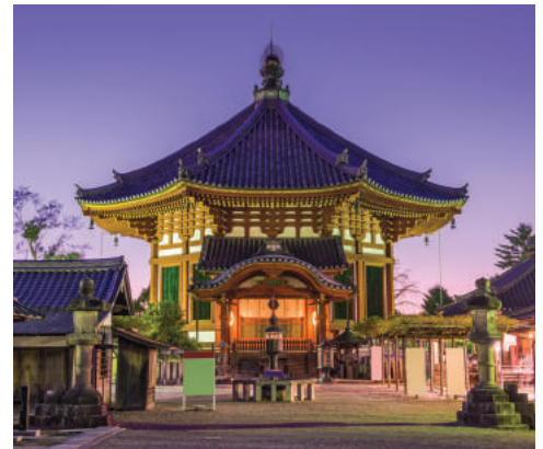
Hakodate City Museum of Northern Peoples (top); Enoura Observatory, Odawara (center); Kofuk-ji Temple, Nara (above)