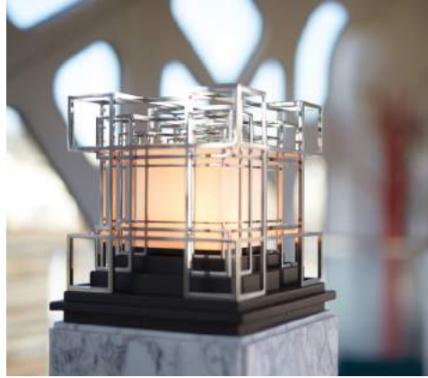
Train Suite Shiki-shima design detail

This itinerary is subject to change at the discretion of The Metropolitan Museum of Art and Arrangements Abroad. For complete details, please carefully read the terms and conditions at www.arrangementsabroad.com/terms .