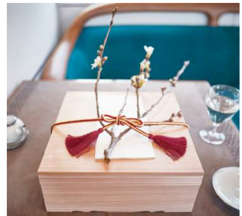
Dinner service on Train Suite Shiki-shima