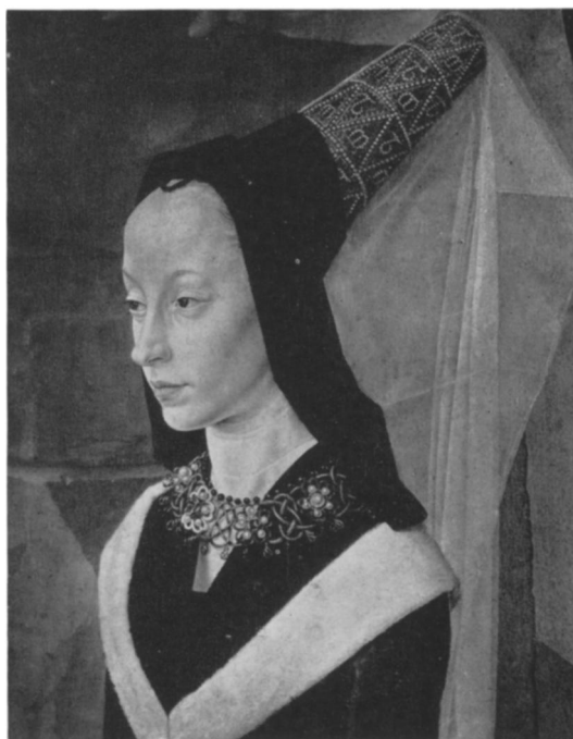
Maria Portinari, detail of the right wing of the Adoration of the Shepherds, by Hugo van der Goes. Flemish, about 1475. Uffizi

One of the greatest paintings in the entire course of early Flanders is the large triptych with the Adoration of the Shepherds by Hugo van der Goes. It is now in the Uffizi in Florence, having been commissioned by Tommaso Portinari—doubtless the most useful enterprise of his entire career. On the left wing, in