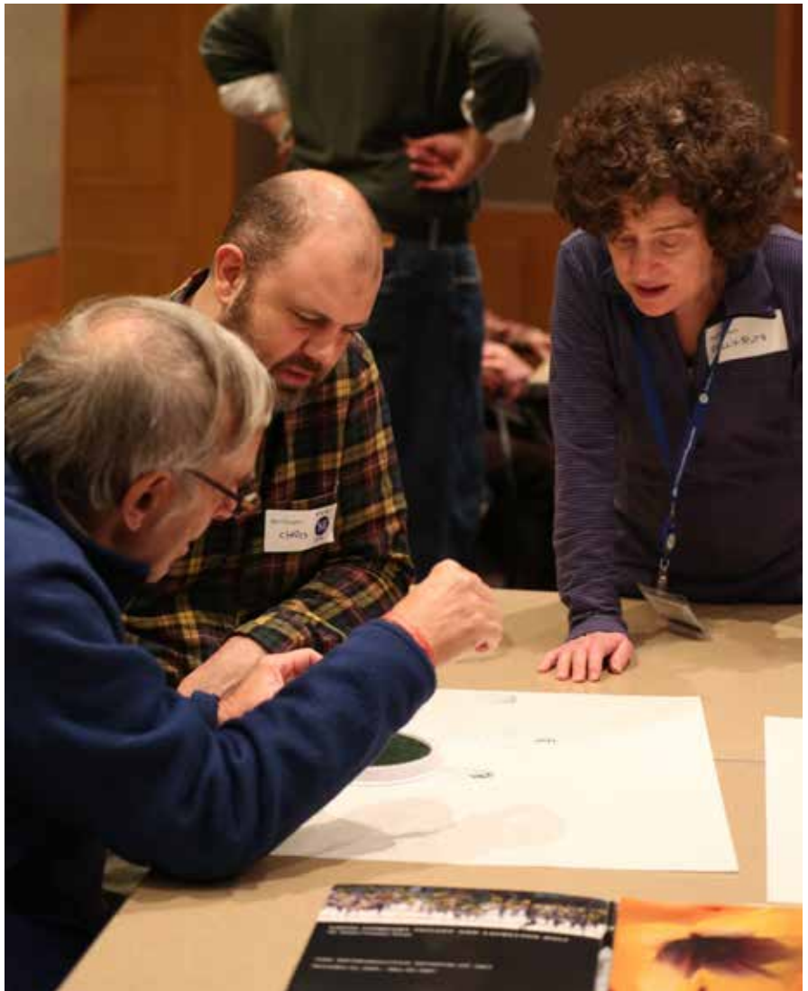
Right: Photo by Tanya Ahmed

Interested in a program for group residences and other agencies that serve people with dementia? See page 16 for information.