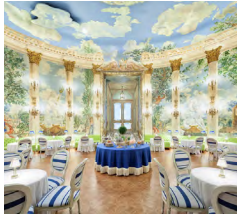
The Rotunda Room, The Pierre