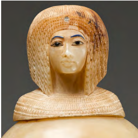
Egyptian, Canopic Jar (07.226.1) with a Lid in the Shape of a Royal Woman's Head (30.8.54), ca. 1349–1336 B.C. or shortly thereafter. Travertine (Egyptian alabaster), blue glass, obsidian, unidentified stone, The Metropolitan Museum of Art, New York. Gift of Theodore M. Davis, 1907 (07.226.1) Theodore M. Davis Collection, Bequest of Theodore M. Davis, 1915 (30.8.54) Theodore M. Davis Collection, Bequest of Theodore M. Davis, 1915 (30.8.54)