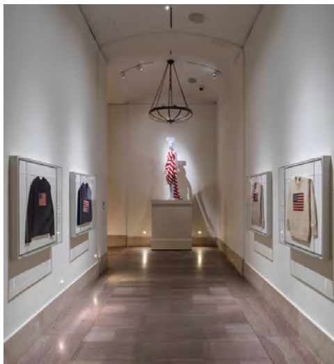
In America: A Lexicon of Fashion , Gallery View, Belonging, The Metropolitan Museum of Art

This afternoon, arrive in New York City independently, and check in at the elegant and refined The Pierre, boasting a superb location across from Central Park and luxury rooms and suites. Meet with your fellow travelers for an intimate afternoon tea and insightful conversation about fashion with a special guest. T