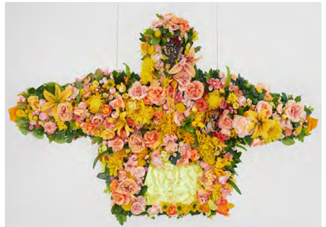
From The Museum of Art and Design exhibit, Garmenting: Costume as Contemporary Art , Devan Shimoyama, February II, 2019. Silk flowers, rhinestones, jewelry, sequins, and embroidered patch on cotton hoodie with steel armature, coated wire and fishing line, Courtesy Private Collection and De Buck Gallery, New York, Photo: Phoebe dHeurle