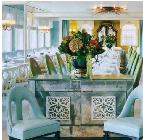
The BG Restaurant at Bergdorf Goodman

Head to the Museum of Arts and Design for a look at Garmenting: Costume as Contemporary Art , the first global survey exhibition dedicated to the use of clothing as a medium of visual art. Peruse the work of 35 international contemporary artists, from established names to up-and-coming voices, and examine how garmenting uses the language of fashion to challenge traditional divisions of form and function. Lunch is at the elegant Robert, the museum's restaurant overlooking Central Park and Columbus Circle. Continue to the iconic Ralph Lauren Women & Home Flagship store for an insider's tour. Enjoy an intimate conversation to learn more about the history and culture