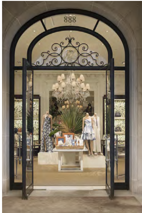
Ralph Lauren Women's & Home Flagship store, photo courtesy of Ralph Lauren